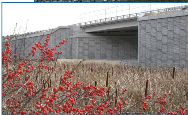
I-93 Widening, Salem-Manchester, New Hampshire

Offices Throughout New England and Worldwide